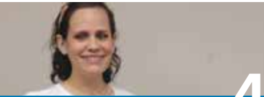
Bariatric Surgery 4