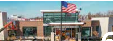
Centerburg Center 6