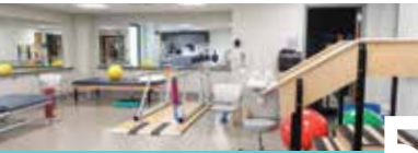
Acute Rehab Team 5